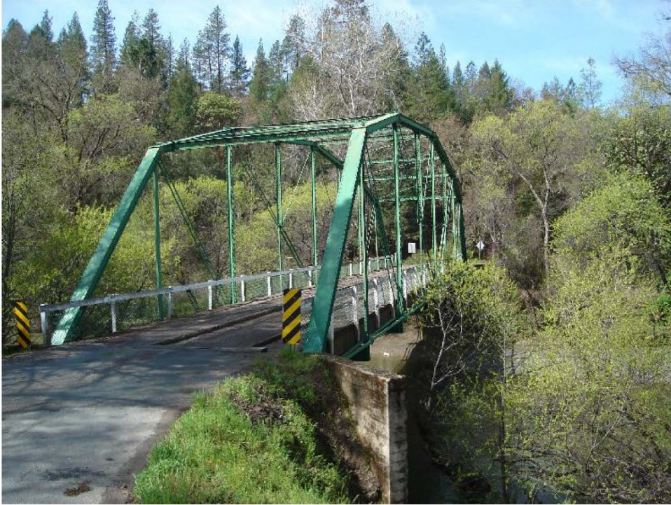
Existing one-lane bridge