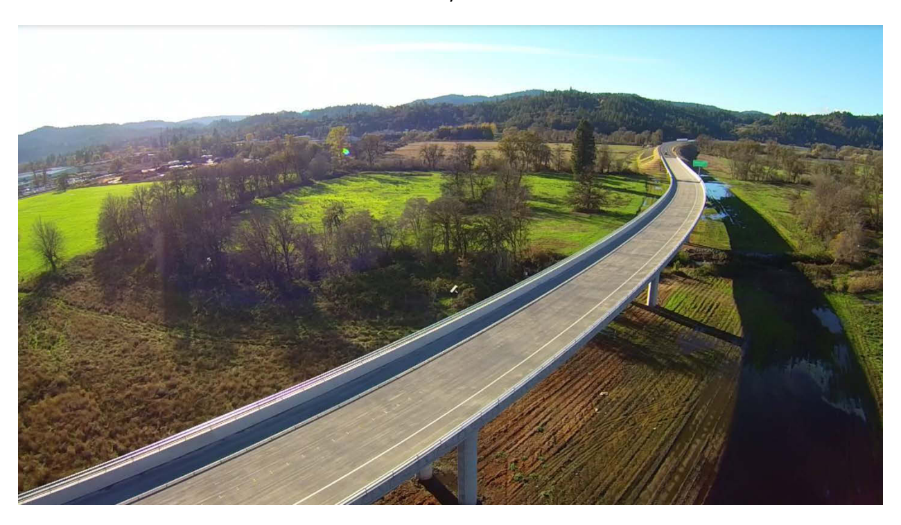
Approaching the Northern Interchange