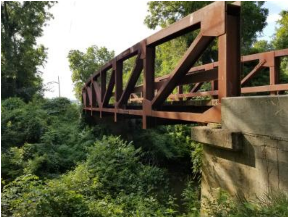
Example of new bridge