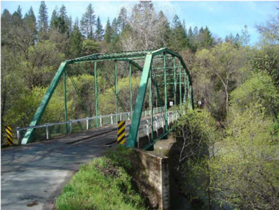
Existing one-lane bridge